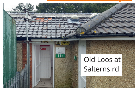
Old Loos at Salterns rd