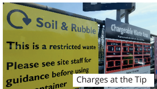
Charges at the Tip

People are concerned that this encourages fly tipping and use of the wheeled bins to get rid of material that should be recycled.