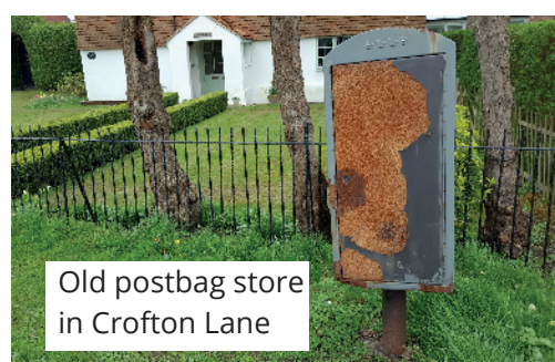
Old postbag store in Crofton Lane

Please let's all drive a bit slower around our village and make it a safer place to live.